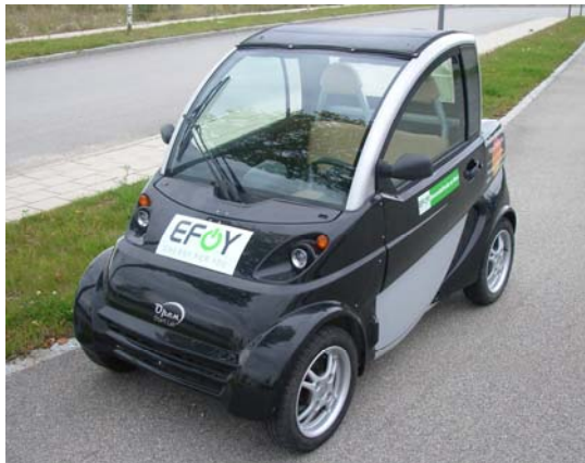
Figure 1: Start Lab EV powered by SFC's EFOY fuel cell

Small EVs weighing less than 500 kg, with one to two seats and a maximum speed of 45 to 65 km/h, are usually equipped with batteries with a capacity of three to five kWh and a system voltage of 48V or 72V. At an energy demand of four to seven kWh per 100 km these vehicles have a reach of approximately 50 km. This, of course, varies considerably depending on the driving style, the traffic situation, and the terrain to be covered, with the result that in city traffic the reach usually is limited to 30 to 40 km. After that the vehicle has to have reached a location where it has access to a power socket or another charge station.