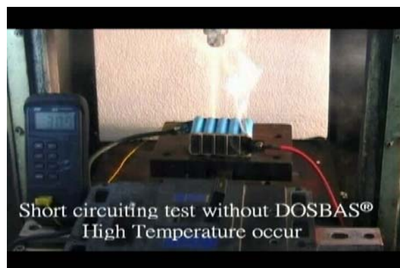
Figure 5 Photographic picture of a battery pack assembled with 10 cells in C- \text{LiFePO}_4 chemistry being short-circuit tested with thermal runaway results; the final cell temperature being at 309 C as indicated on the thermometer.