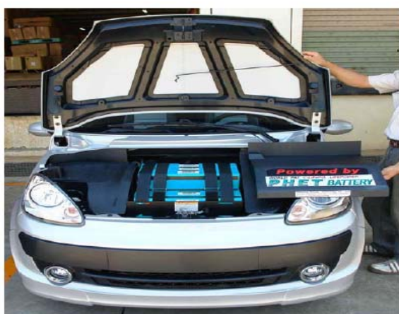
Figure 7 Photographic picture of an electric car powered by the DOSBAS ® battery system configured for 72V and 120AH under the hood.