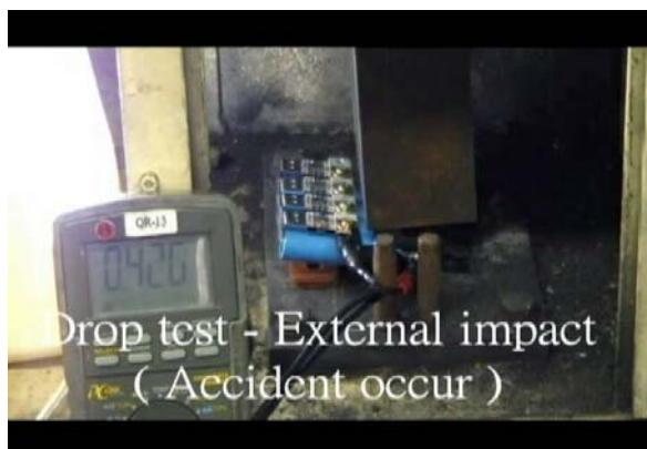
Figure 7 Photographic picture a DOSBAS ® battery pack safely passed the drop-test for simulating external impact forces; 0.426 volt of residual voltage being measured on the pack.