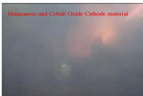
Figure 2 Photographic picture of nail-penetration test on a standard 18650 cell made of \text{LiCoO}_2 , \text{LiMn}_2\text{O}_4 chemistry; heavy smoke and flames being observed.