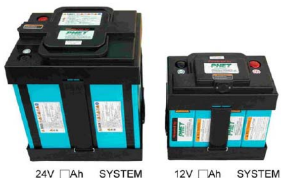
Figure 8 Photographic picture of two battery packs assembled for 12V and 24V applications embedded with the DOSBAS ® system and voltage balancing boards on top of the packs.