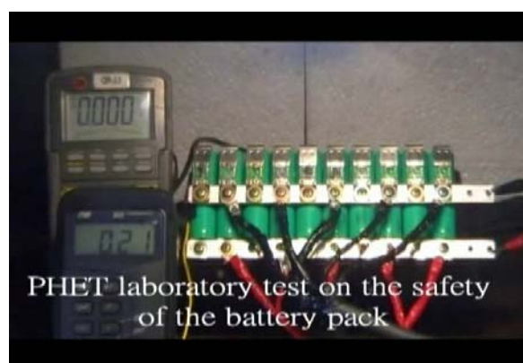
Figure 6 Photographic picture of a DOSBAS® battery system assembled with cells in C- \text{LiFePO}_4 chemistry being short-circuit tested with no increase in cell temperature and visible cell damage except the blown fuses.