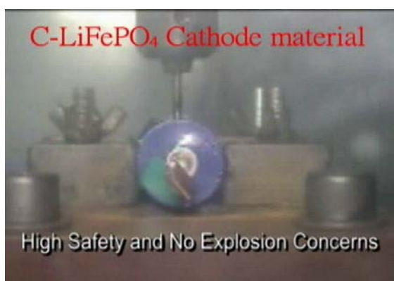
Figure 3 Photographic picture of nail-penetration test on a standard 18650 cell made of C- \text{LiFePO}_4 chemistry; little smoke and no flame being observed.