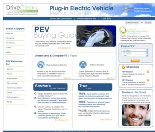
Figure 2: PEV Resource Center Microsite Homepage

The Resource Center shown in Figure 2 is an impartial source of information designed to help various audience groups better understand plug-in electric drive technology and to provide car buyers with the information they need to purchase and own a PEV. The primary objective of this online tool is to provide clear, concise, accurate, and unbiased information to facilitate PEV market growth and achieve health-based air quality, climate, and energy goals.