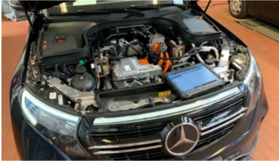
Figure 3: Disconnecting HV System of a Mercedes EQC

Applied to one individual EV model – see figure 3 as an example Mercedes-Benz EQC –, the procedure can be modelled in many different ways [3], [4].