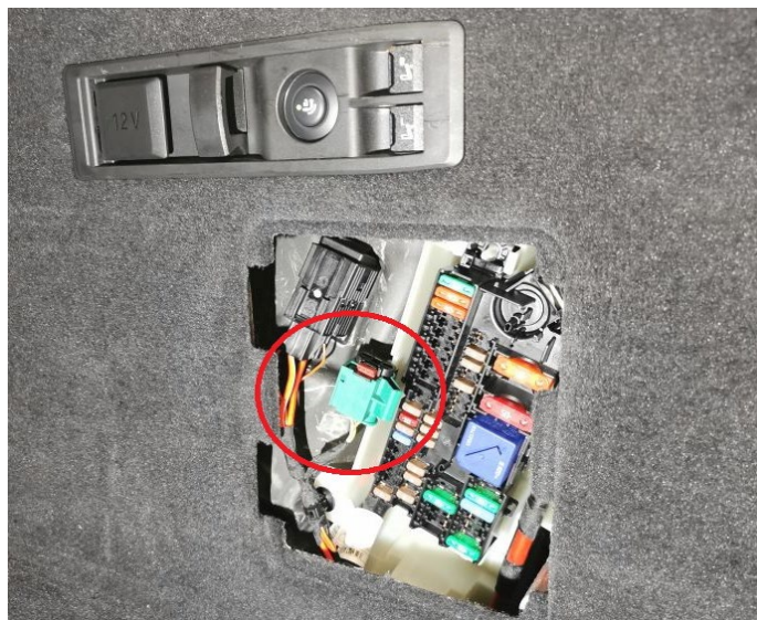
Figure 2: Easily accessible HV service plug in the trunk