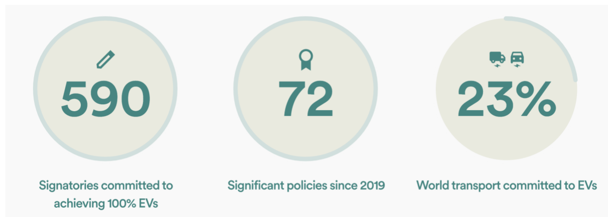
Figure 2. Our progress on the road to 100% electric road transportation

The next five years are a crucial window of opportunity to shift out of business as usual. Drive Electric partners are accelerating the transition to all electric vehicles for all types of road transportation, all around the world (see Figure 2). We are tracking progress toward critical tipping points, building momentum in public and private sectors to reach 100% zero-emission road transportation by 2050.